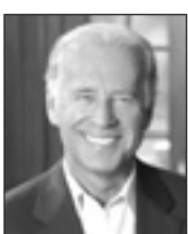
Joe Biden Vice-Presidential Candidate

Biography: Obama began his career as a community organizer on Chicago's South Side and headed a voter registration drive. Obama practiced civil rights law and taught constitutional law. He served eight years in the State Senate before his election to the U.S. Senate. He graduated from Columbia University and Harvard Law.