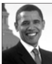
Barack Obama Democratic Presidential Candidate www.barackobama.com

Biography: Obama began his career as a community organizer on Chicago's South Side and headed a voter registration drive. Obama practiced civil rights law and taught constitutional law. He served eight years in the State Senate before his election to the U.S. Senate. He graduated from Columbia University and Harvard Law.