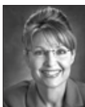
Sarah Palin Vice-Presidential Candidate

chairman of the Commerce Committee and ranking member of the Armed Services Committee.