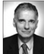
Ralph Nader Independent Presidential Candidate www.votenader.org

Biography: Attorney, author, and consumer advocate, named by Time Magazine one of the "100 Most Influential Americans in the 20th Century." Over 4 decades of public service. Helped establish the OSHA, EPA, Consumer Product Safety Commission, the Safe Drinking Water Act, Motor Vehicle Safety Act, and Freedom of Information Act.