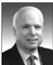
John McCain Republican Presidential Candidate www.johnmccain.com

Biography: John McCain graduated from the Naval Academy and served for 22 years as a naval aviator. He was elected to the House of Representatives in 1982 and the Senate in 1986. He has served as